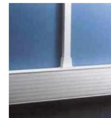
Adaptors provide integration with Ega Mini and Communication Trunking for local distribution.