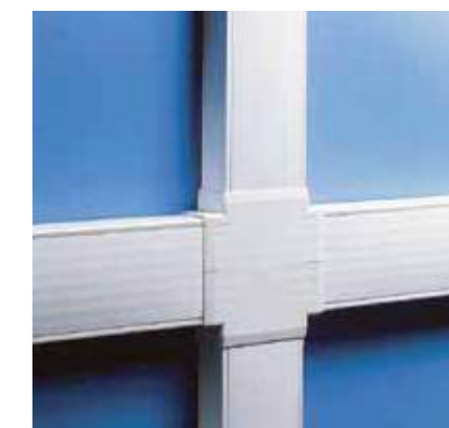
Moulded flat cross available for all distribution trunking.